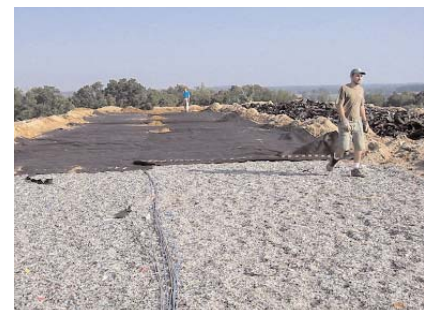
Researchers at this bioreactor landfill are testing the liquids distribution system using permeable blankets built into the lifts.