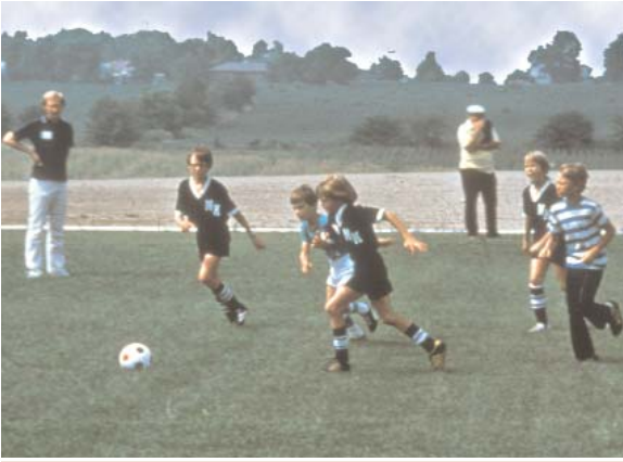
Category 2 uses for closed landfills include children's playgrounds such as this soccer field.

Category 2 uses are more intensive and are typically characterized by not having major structures, but may have utilities, light structures, or paving. Examples are: