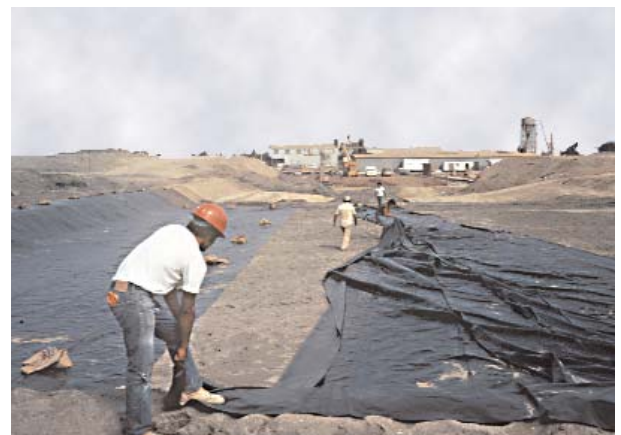
Synthetic materials can be used as landfill liners to prevent contamination of groundwater resources.

Waste is placed directly above the leachate collection system in layers. Delivered waste is placed on the working face that is maintained as small as possible to control odors and vectors. Heavy steel-wheeled compactors move the waste into the working face to reduce the waste's volume. At the end of each