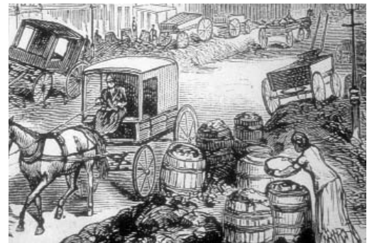
In the late 1860s, garbage was placed in leaking barrels on the street edge and picked through by salvagers and otherwise left for animals.

In 1935, the precursor to the modern landfill was started in California where waste was thrown into a hole in the ground that was periodically covered with dirt. The American Society of Civil Engineers in 1959 published the first guidelines for a "sanitary landfill" that suggested compacting waste and covering it with a layer of soil each day to reduce odors and control rodents.