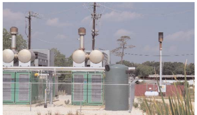
Gas collection systems at modern landfills can be used to generate electricity to supply energy to local communities.

According to recent EPA studies, modern landfills generate significantly lower concentrations of non-methane organic compounds than older sites. Of 42 non-methane organic compounds regulated by federal clean air rules, 59 percent of them are one to three orders of magnitude lower (an order of magnitude is a ten fold decrease) in concentration in modern landfills than in older landfills. In fact, 3 of 24 non-methane organic compounds were not detected at modern landfills, but were present at high concentrations in older landfills. Since comparable data are from test programs conducted in the late 1980s, older landfills are likely to have higher concentrations of non-methane organic compounds than modern landfills.