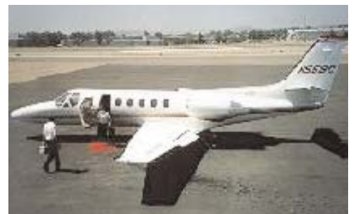
Palomar Airport is partially built on a Category 1 closed landfill.