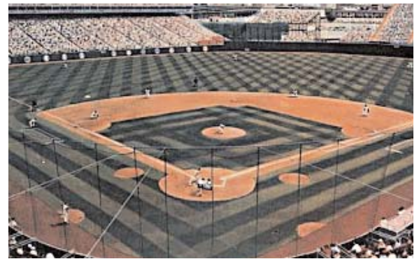
Mile High Stadium near Denver, Colorado is an example of a Category 3 post-closure use.