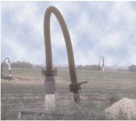
Gas collection wells at modern landfills protect public health by preventing methane from migrating off-site.

When MSW is disposed of in a landfill, naturally occurring microorganisms (bacteria) degrade the waste. The amount of water in and the temperature of the MSW control the rate of degradation. This process turns the organic portion of the waste into methane (a primary constituent of natural gas) and carbon dioxide in about equal proportions. The degradation process also generates very small quantities of organic compounds.