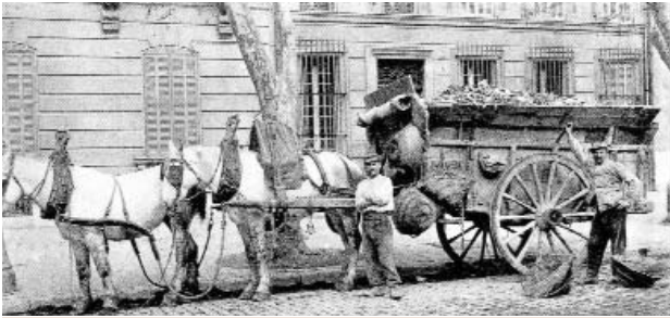
Early efforts at waste collection in cities consisted of horse-drawn wagons.

The first federal legislation addressing solid waste management was the Solid Waste Disposal Act of 1965 (SWDA) that created a national office of solid waste. By the mid-1970s, all states had some type of solid waste management regulations. However, the contents of these regulations varied widely. During this time, many state laws banned the open burning of waste at dumps and began replacing them with sanitary landfills. In addition, some states required disposal facilities to obtain permits and meet minimal design and operational standards.