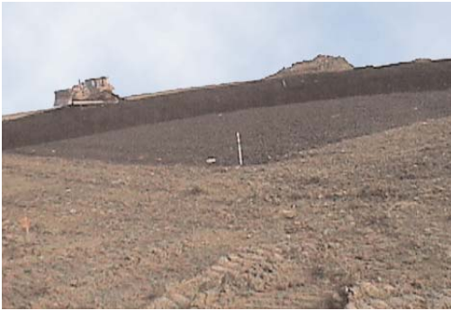
Researchers at this bioreactor landfill are testing the use of biocovers as an alternative cap system.

Another promising innovation is the use of biocovers (composted yard waste used as final cover) to further reduce air emissions at landfills. The benefits of biocovers are that air emissions of methane and other organic compounds are oxidized and destroyed in the biologically active compost. Research has shown that biocovers are effective for controlling air emissions when used: