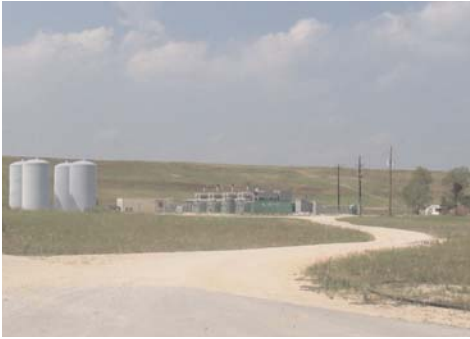
A modern municipal solid waste landfill with a gas collection and energy recovery system.

Regardless of where we live, work, or play, we generate trash. According to the United States Environmental Protection Agency (EPA), American's generated 236.2 million tons of municipal solid waste (MSW) in 2003 and more than half (130.8 million tons) was disposed of in landfills (1).