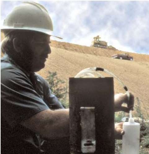
Testing of water samples in groundwater monitoring wells at modern landfills ensures that leachate collection systems are working correctly to protect public health and the environment.

most cases, contaminant concentrations in leachate from modern landfills are one to two orders of magnitude less compared to older landfills. Moreover, EPA research anticipates that the quality of leachate will continue to show improvement over time as the existing public database for modern landfills increases.