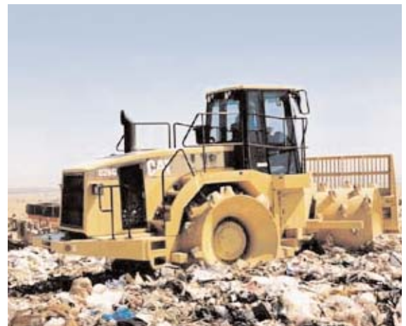
Compactors are used on the working face of landfills to move garbage and reduce the waste's volume.

In short, the sophisticated engineered systems in a modern landfill ensure protection of human health and the environment by containing leachate that can contaminate groundwater, preventing the infiltration of precipitation that generates leachate after closure of the landfill, and collecting landfill gas which can be used as an energy source or destroyed.