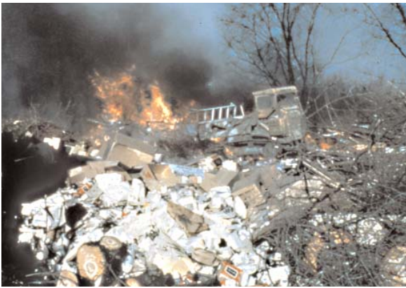
Old landfills used open burning to reduce space, but also created air pollution.

In less than 30 years, landfills changed from little more than holes in the ground to highly engineered, state-of-the-art containment systems requiring large capital expenditures. Typically, older landfills were designed by excavating a hole or trench, filling the excavation with trash, and covering the trash with soil. In most instances, the waste was placed directly on the underlying soils without a barrier or containment layer (liner) that prevented leachate (water percolating through the waste and picking up contaminants) from moving out of the landfill and contaminating groundwater (6).